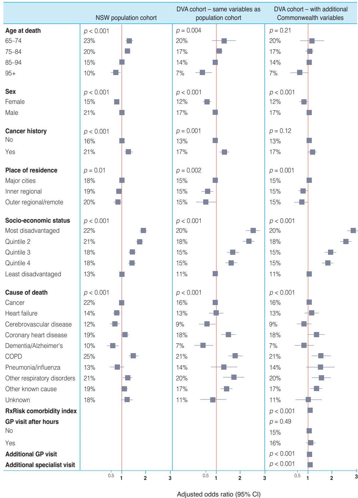
Figure 2. Associations between cohort characteristics and \geq 3 ED presentations a during the last 6 months of life for the population cohort and DVA cohort

CI = confidence interval; COPD = chronic obstructive pulmonary disease; DVA = Department of Veterans' Affairs; ED = emergency department; GP = general practitioner